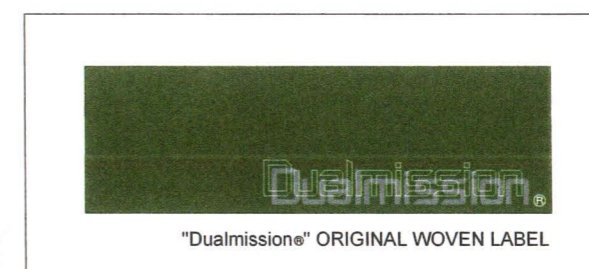
"Dualmission®" ORIGINAL WOVEN LABEL