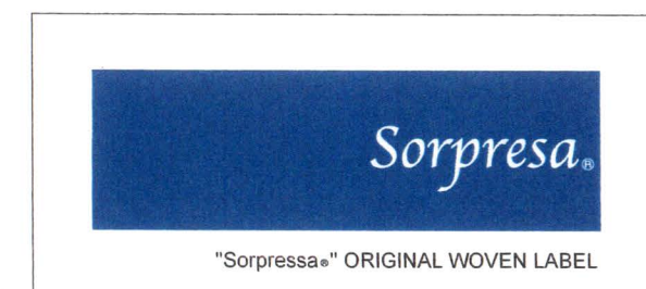
"Sorpresa®" ORIGINAL WOVEN LABEL