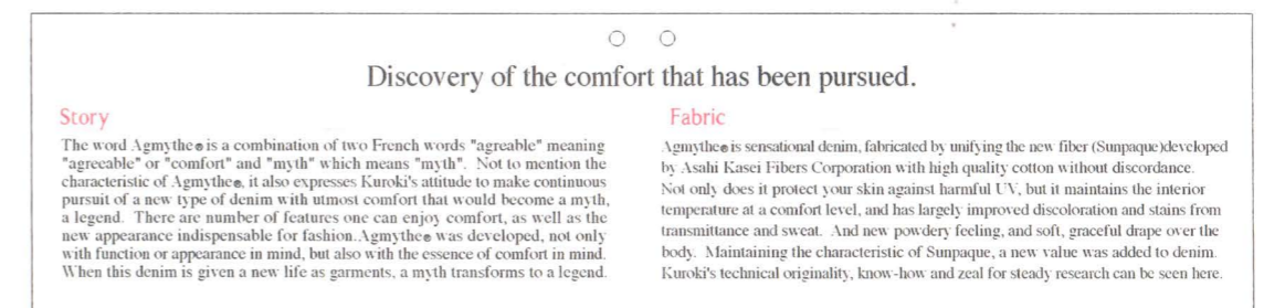
"Agmythe®" ORIGINAL LABEL